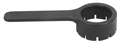
-ART. 725/ A942040N Key for valve BRAVO 260 H.V.